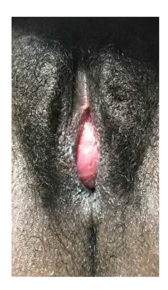
Fig. 1: Anterior vaginal wall lesion occupying the introitus on initial vaginal exam.

The patient is a 19-year-old primigravid who presented to the emergency room at 9 weeks gestation complaining of a painful vaginal mass. She reported noticing a small "bump" in her vagina that steadily grew over one week, becoming increasingly painful. She reported dysuria but denied other urinary symptoms. She additionally reported no vaginal discharge and had no signs or symptoms of local or systemic infection. On external exam, a vaginal mass was seen occupying the vaginal introitus (Fig. 1). Bimanual exam was performed and the mass was exquisitely tender to palpation and non-fluctuant, originating from the distal one third of the anterior vaginal wall along the